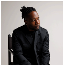
Winston "Winne" Bergwijn